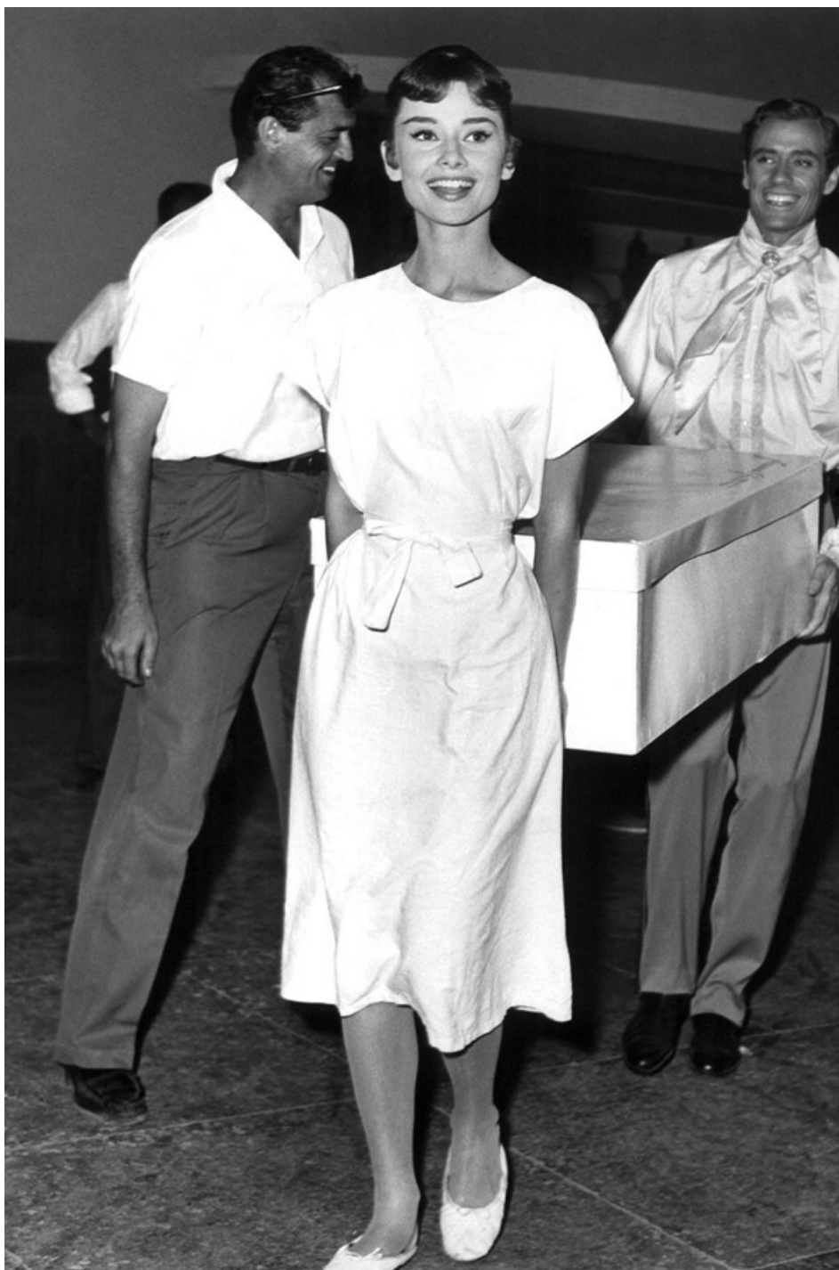
Filming 1956 classic War and Peace.

With effortless style on set, Audrey matches a simple shift dress and pumps.