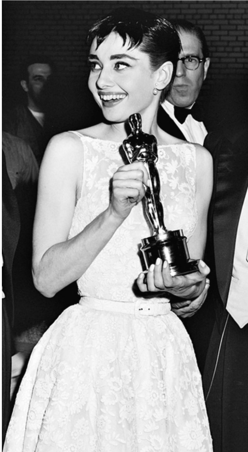
Audrey at the 28th Annual Awards, wearing Givenchy.