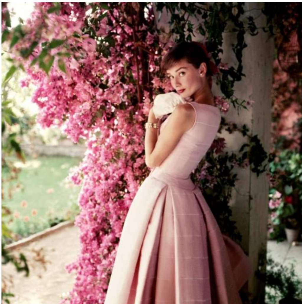
Captured in 1955 by Norman Parkinson, wearing a pink Givenchy gown.