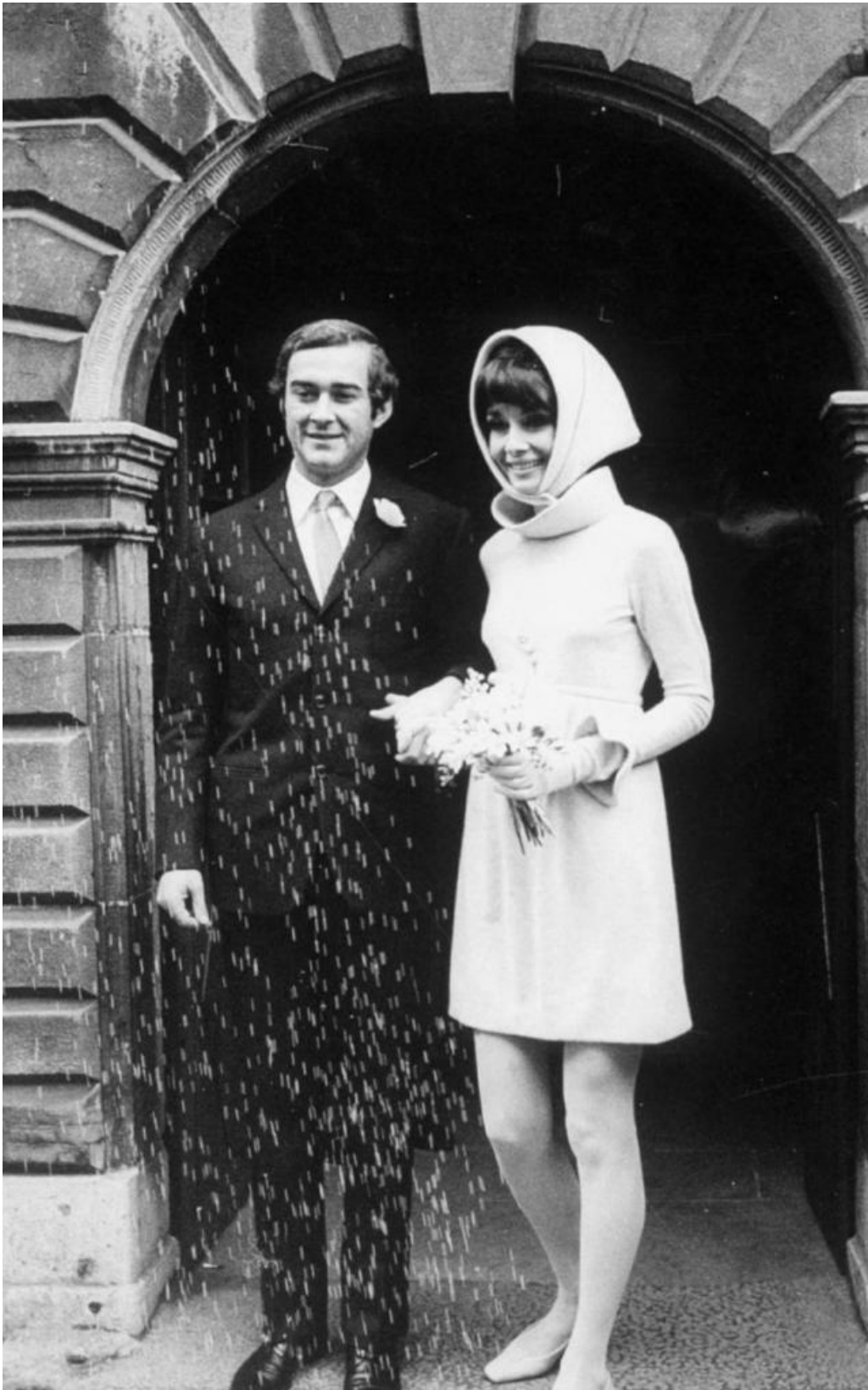
Audrey married Italian psychiatrist Andrea Dotti in January 1969.

A lover and famous advocate of the headscarf, Audrey opted for a fashion statement even on her wedding day.