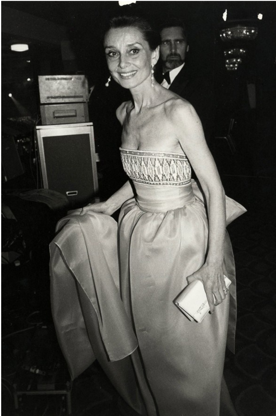
At the BAFTA awards in London.

Even into her fifties, Hepburn demonstrated the ability to set trends on the red carpet. Attending the 1984 BAFTAs, Audrey wore a silk strapless gown. Unafraid to experiment with design, the dress embodied a geometric patterned bodice complemented by a flowing skirt.