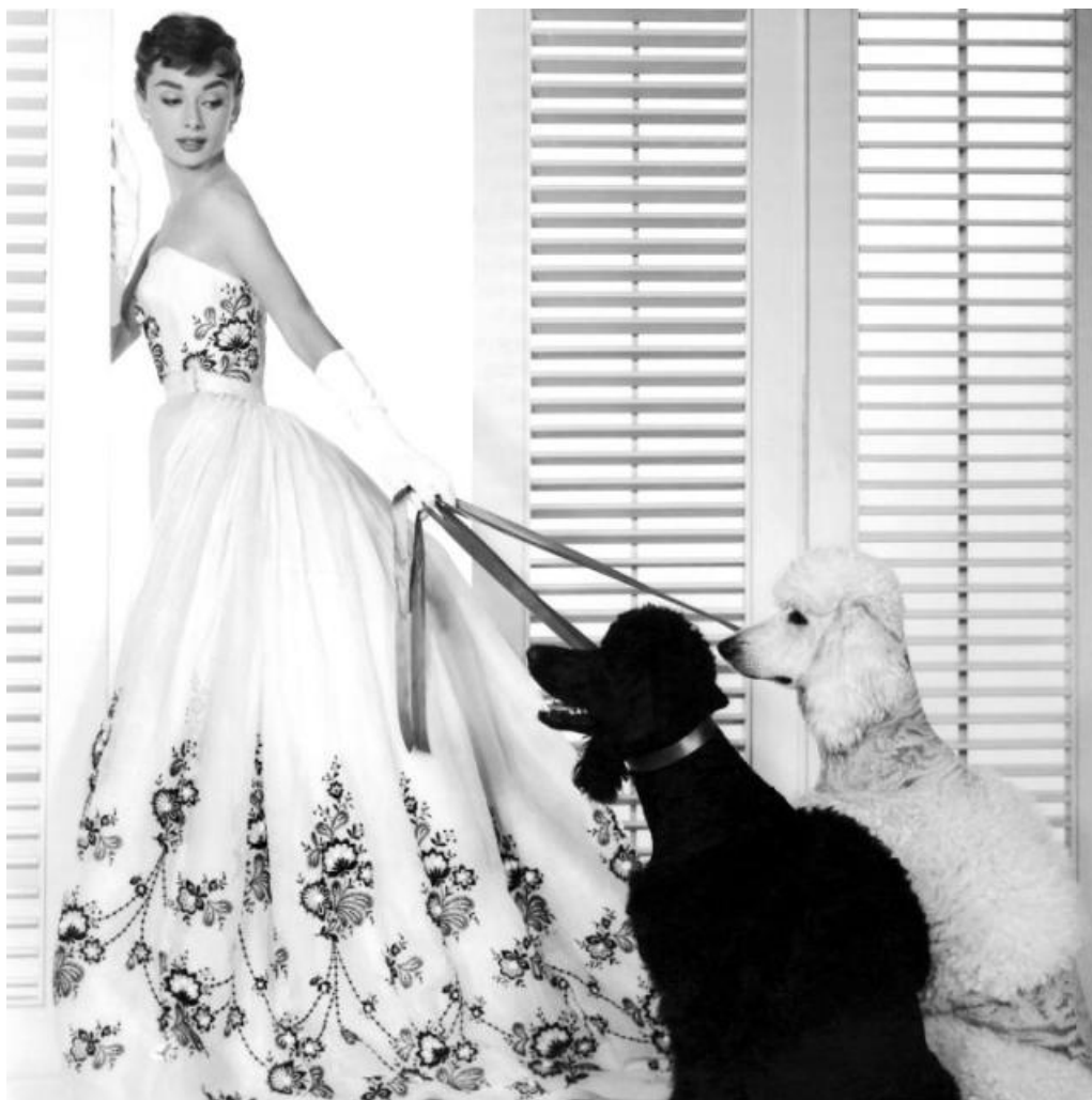
Starring in Sabrina sparked a long-term partnership between Audrey and Givenchy.

Audrey founded her status as a fashion muse whilst filming Sabrina . On set, Hepburn became acquainted with designer, Hubert de Givenchy. The start of long life partnership whereby Hepburn became muse for the designs of Givenchy soon followed. Hepburn later commented, "His are the only clothes in which I am myself. He is far more than a couturier; he is a creator of personality."